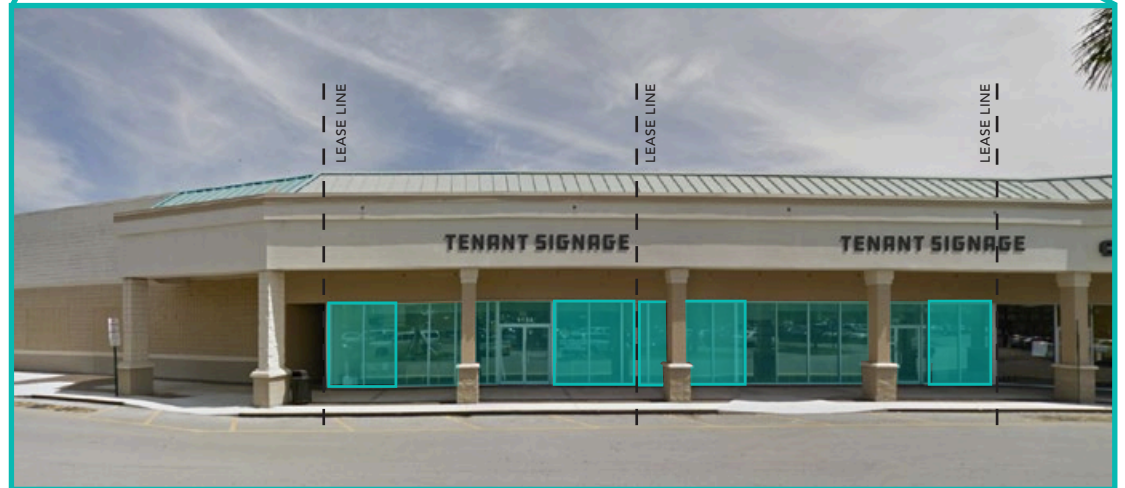
WINDOW GRAPHIC REFERENCE

Creative window graphics that promote the business brand / advertising are encouraged but will need to be reviewed by the Landlord and City of Coral Springs (Not to exceed 40% of window area)